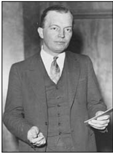
Harold Stassen in 1937