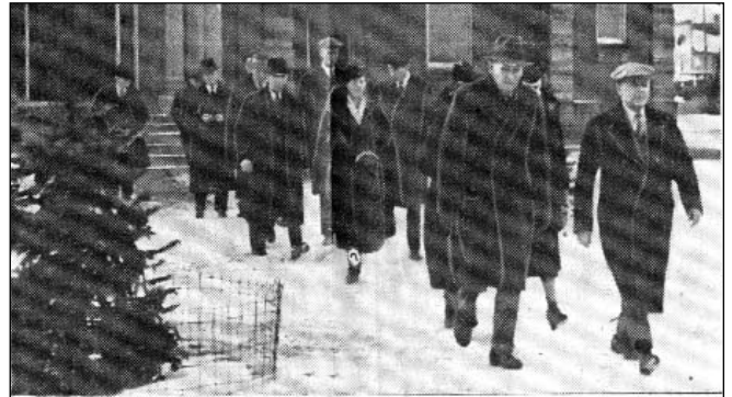
Jurors are carefully insulated from contact with public, newspapers, relatives or counsel when they walk from the courthouse to the hotel where they get their meals and spend the night. Should a juror talk with any outsider a mistrial might be called and the whole trial have to be gone through again.