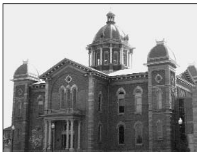
The trial was held at the old Dakota County Courthouse in Hastings.